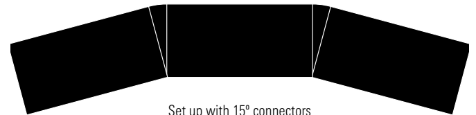
Set up with 15° connectors

Corner connectors available in 90° (shown in photo at top), 30°, or 15° to create a variety of configurations to fit in any environment. Ideal for training rooms, classrooms, or other group instructional settings.