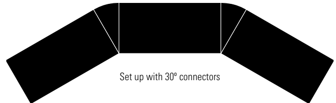
Set up with 30° connectors