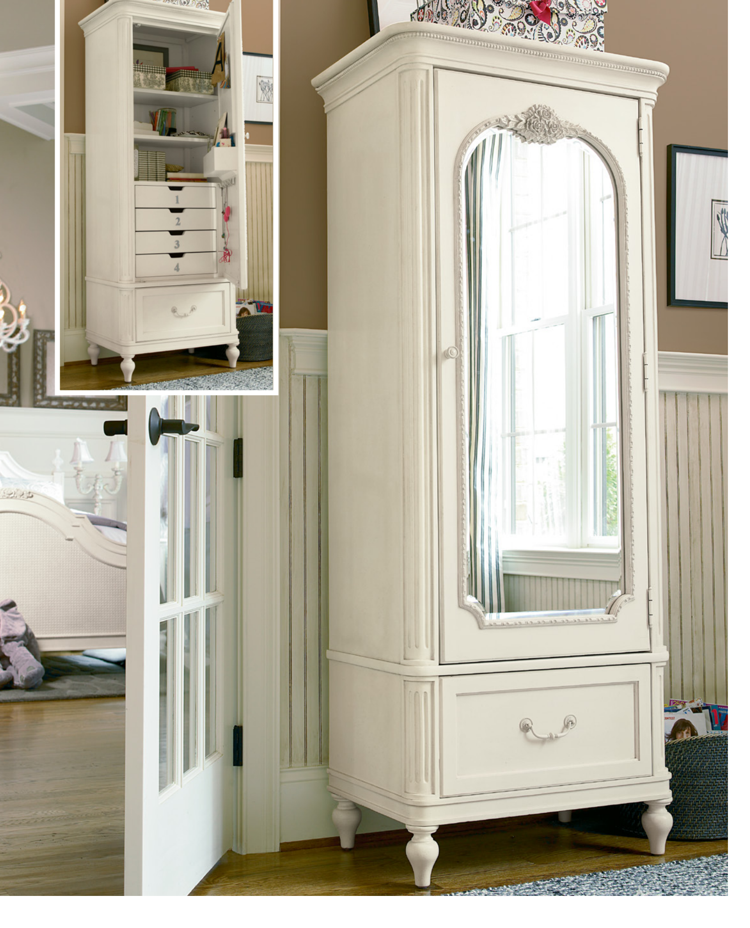
Armoire 136A014 / 29w x 19d x 71h