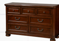
1341002 DRAWER DRESSER 56W x 18D x 34H • Top left game console/DVD player drawer • Removable felt-lined tray reveals hidden storage in top right drawer • Removable dividers in bottom drawers Shown on pages: 6, 8