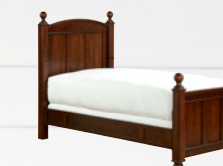
LOW POST BED 1341037 3/3 Twin 1341042 4/6 Full Twin Bed: 43W x 84D x 57H (footboard height is 34") Full Bed: 58W x 84D x 58H (footboard height is 34") • Left post opens to reveal LED snake light Shown on pages: 4, 12