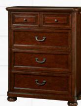
1341010 DRAWER CHEST 40W x 18D x 52H • Top left game console/DVD player drawer • Clothing rods pull out on ends Shown on page: 7