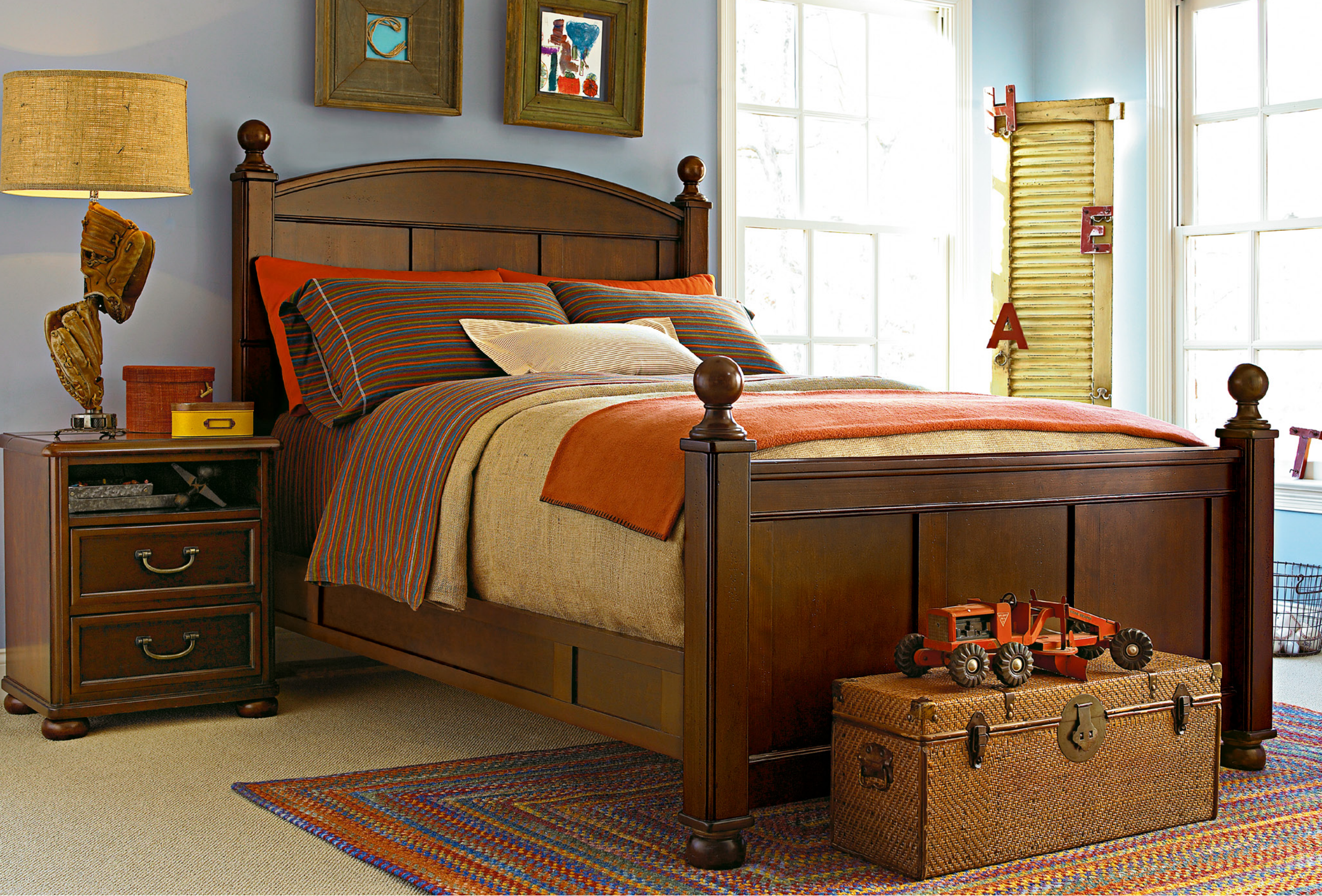
Low Post Bed 1341042 Full 58w x 84d x 58h (footboard height is 34")