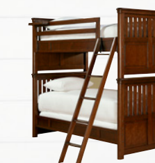
BUNK BED 1341530 3/3 Twin 1341540 4/6 Full Twin Bed: 45W x 83D x 75H Full Bed: 60W x 83D x 75H • Bunk bed ladder steps curved and grooved for better traction • Clock shelf for upper bunk • Metal pegs attach upper bunk to lower bunk • Bunk bed can break down into two twin beds • Accommodates Trundle or Storage Unit Shown on page: 11