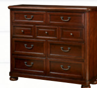
1341004 DRESSING CHEST 52W x 18D x 45H • Top left game console/DVD player drawer • Removable felt-lined tray reveals hidden storage in top right drawer • Removable dividers in bottom drawers Shown on pages: 4, 15