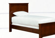
PANEL BED 1341035 3/3 Twin 1341040 4/6 Full Twin Bed: 47W x 82D x 53H (footboard height is 23") Full Bed: 62W x 82D x 54H (footboard height is 23") Shown on pages: 8, 14