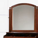
1341033 TILT MIRROR 33W x 11D x 33H • Beveled mirror tilts to various viewing positions • In the back are electrical outlets for mobile phones, iPods, etc. • Scooped-out coin tray Shown on pages: 4, 15