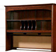
1341020 HUTCH 54W x 15D x 49H Overall with Desk: 55W x 24D x 79H • Hutch fits over 1341027 Desk or 1341002 Dresser • 3-Way dimmer light illuminates work area • Cork back • Easy cord access • Storage shelves with vertical dividers Shown on page: 10