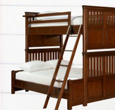
1341590 TWIN OVER FULL EXT KIT 60W x 83D x 75H • Extension kit allows for a 4'-6" full sized mattress on the bottom bunk • Accommodates Trundle or Storage Unit