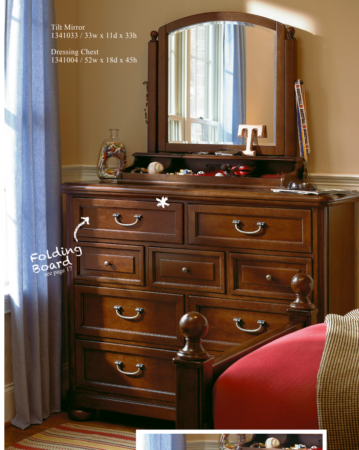
Tilt Mirror 1341033 / 33w x 11d x 33h