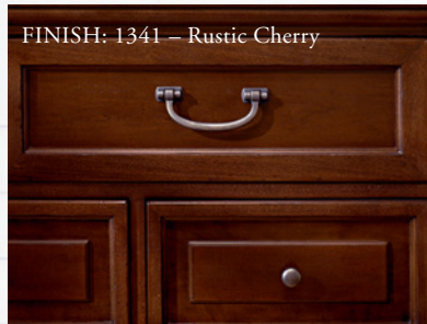
FINISH: 1341 – Rustic Cherry