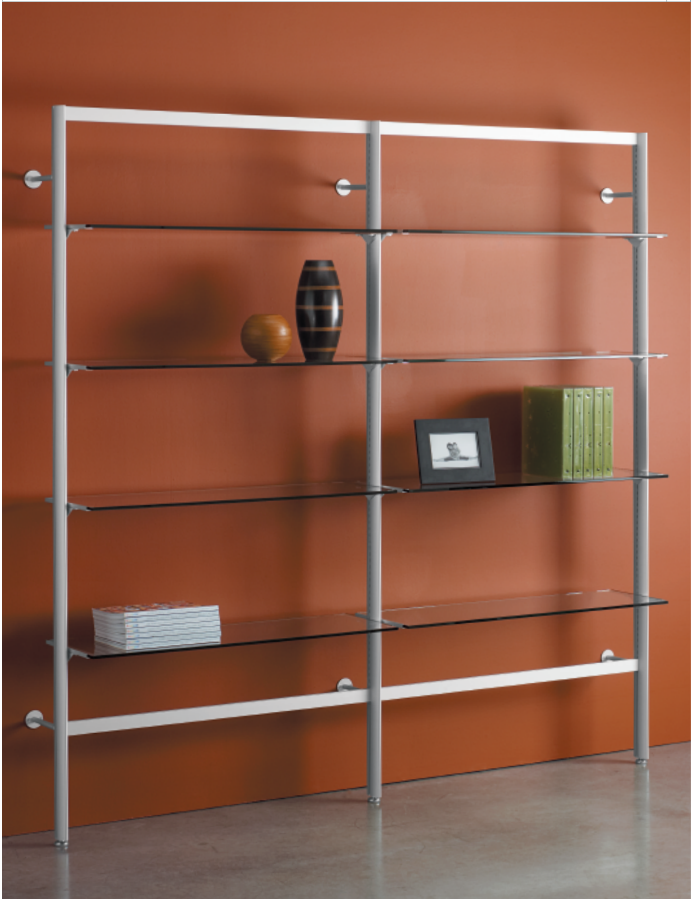
MS2 (2) sections 42"w with glass shelving. 83w x 84h x 13d