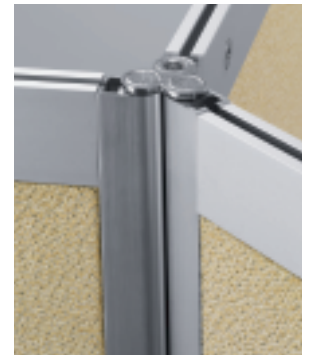
ETP Hinge Connector

Exhibit, Display and Partition panels are easily arranged for presentations and to divide space. Framed in natural anodized aluminum, the dual sided articulating panels may be specified with hard surfaces, tackable fabrics or COM. Ideal for mounting artwork, graphics, announcements and shelving. Create your own configurations with additional 'Add-On' panels.