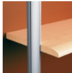
Maple laminate shelf