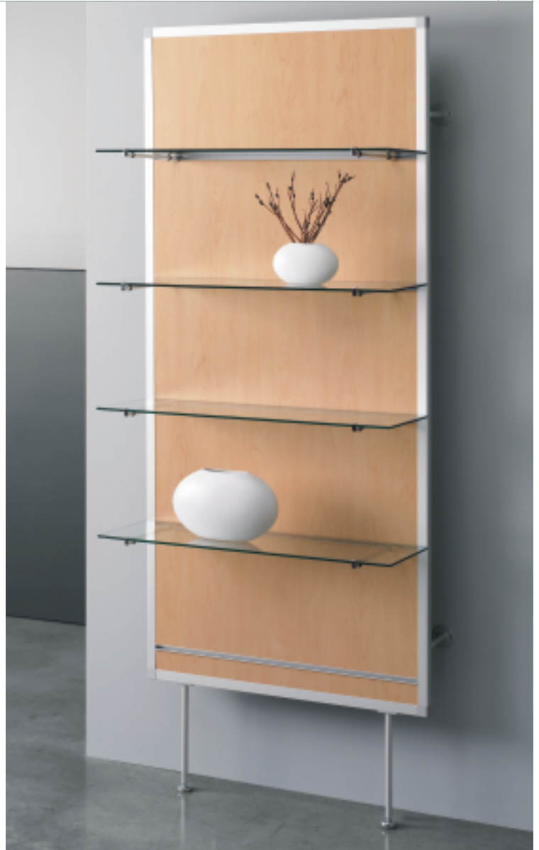
SF3076 Floor Mounted maple panel with glass shelves. Shelf spacing 12"h. 30w x 76h x 15d

Inset panels are framed in a square aluminum extrusion and available in floor standing and wall mounted models. The shelf brackets fit securely into the aluminum connecting profile. Extended glass shelves offer unique styling and maximize the display area.