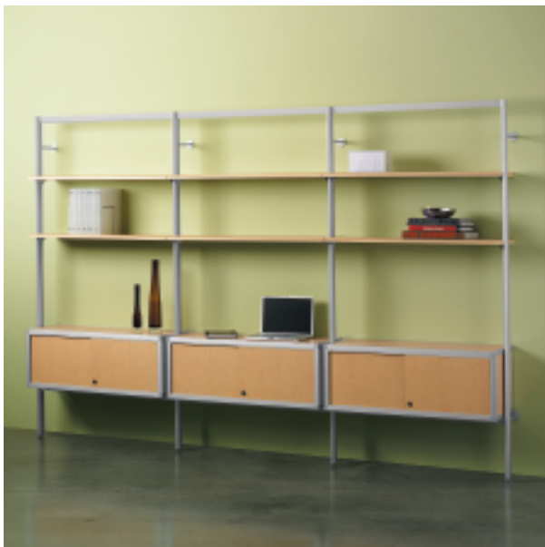
MS3 (3) sections 42" w with locking credenza storage and laminated shelves. Available in unlimited lengths with additional 'Add-On' sections. 123w x 84h x 15d