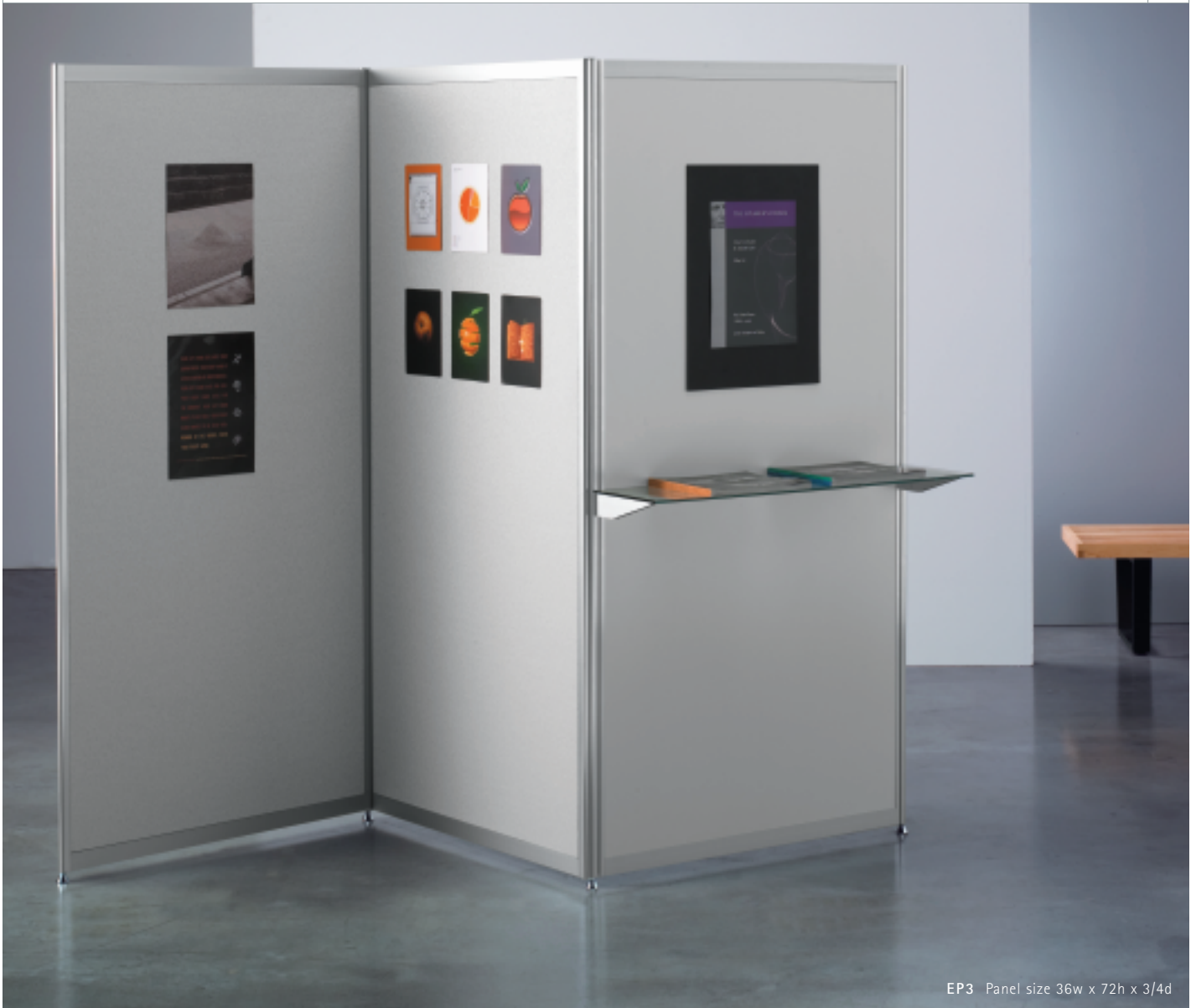
EP3 Panel size 36w x 72h x 3/4d