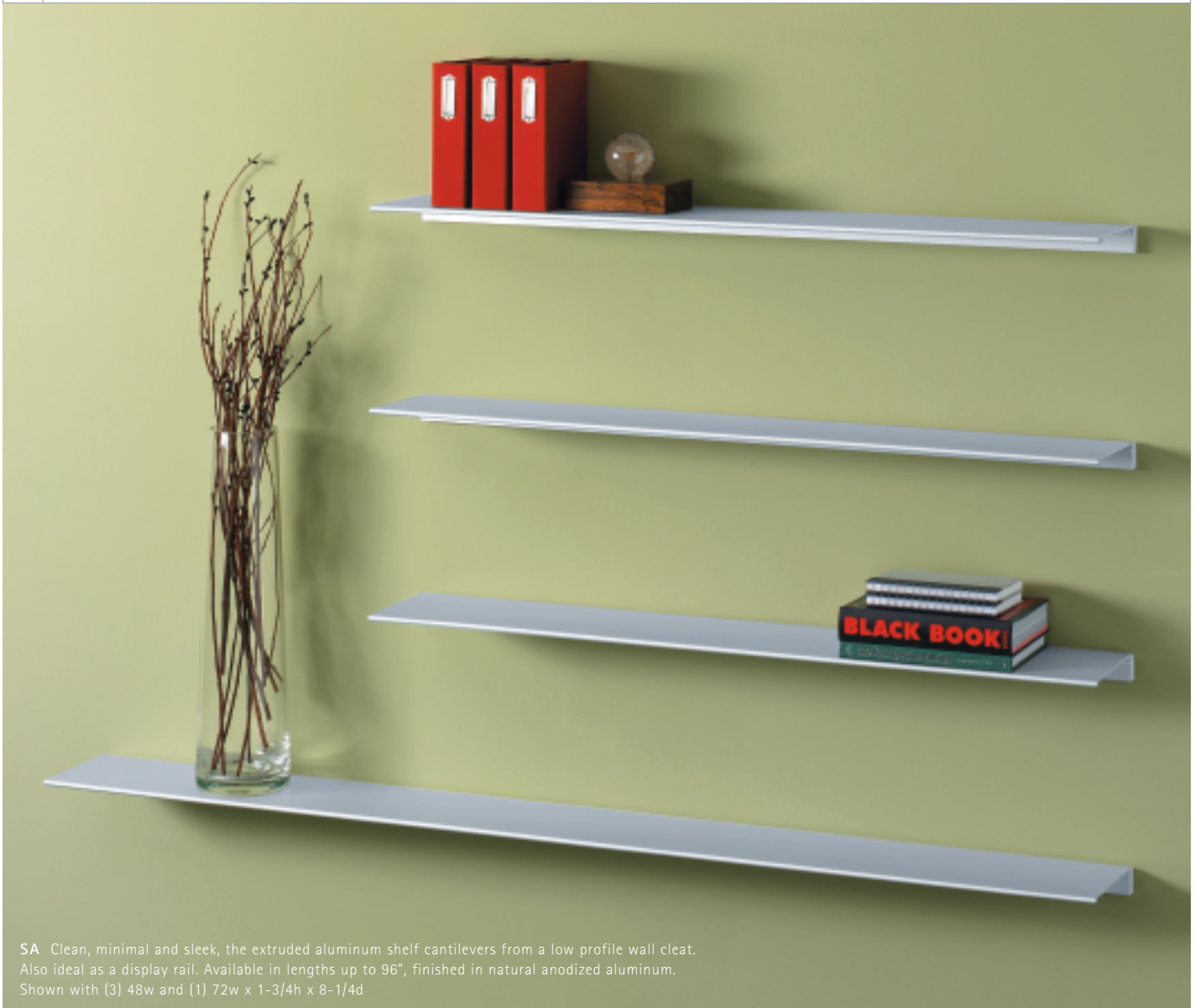
SA Clean, minimal and sleek, the extruded aluminum shelf cantilevers from a low profile wall cleat. Also ideal as a display rail. Available in lengths up to 96", finished in natural anodized aluminum. Shown with (3) 48w and (1) 72w x 1-3/4h x 8-1/4d