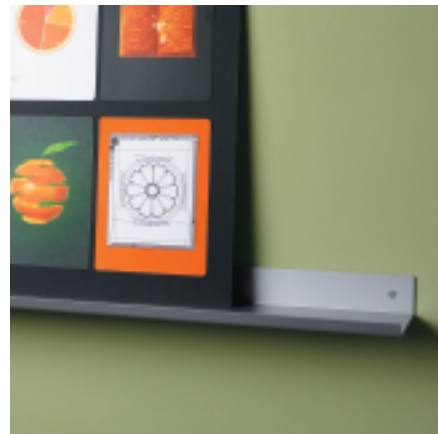
PR Presentation Rail available in lengths up to 96w x 2h x 5-1/2d.