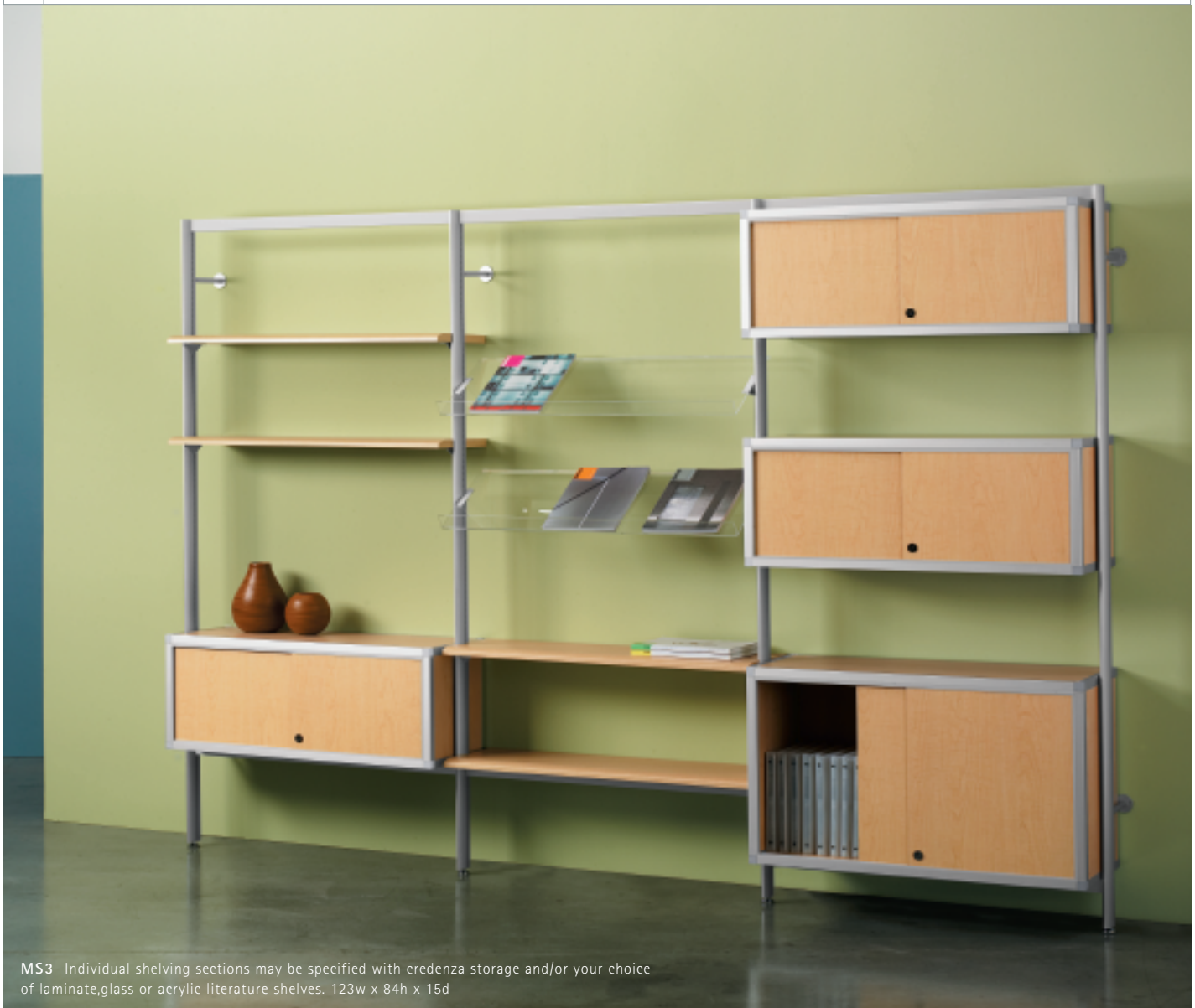
MS3 Individual shelving sections may be specified with credenza storage and/or your choice of laminate, glass or acrylic literature shelves. 123w x 84h x 15d