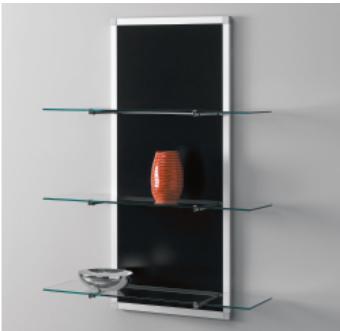
SW1842 Wall Mounted black panel with extended glass shelves. 18w x 42h x 12d