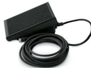
RFCS-RJ45 #245589 Remote foot control.