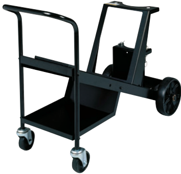
Running Gear/Cylinder Rack #770187 Heavy-duty construction. Accommodates large and small gas cylinders.