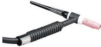
Weldcraft® Legacy™ 17 Replacement TIG Torch 1712RESYLGC #245271 12.5-ft. (3.8 m) TIG torch with backcap, ceramic gas cup, 3/32 in. (2.4 mm) collet and collet body, and 2% ceriated tungsten.