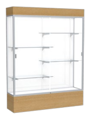
2075 - 5' floor case (pictured in light oak base, satin natural frame & white backing shown with optional 2172-5 cornice) aluminum framed case with 4 half-length adjustable shelves 80"H x 60"W x 16"D