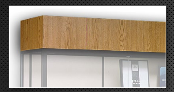
Optional Matching Cornice Fluorescent lights offer a sleek, low profile design that illuminates your case.