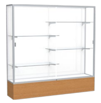
2076 - 6' floor case (pictured in carmel oak base, satin natural frame & white backing) auminum framed case with 4 half-length adjustable shelves. 72"H x 72"W x 16"D