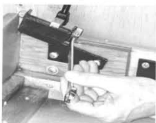
Fig. 2 Adjust Tension

Adjust the tray connections another 1/2" toward the foot end of the bed by turning the bolt head clockwise. (Fig.2) This will compress the piston and keep the bed firmly closed when it is in the installed position.