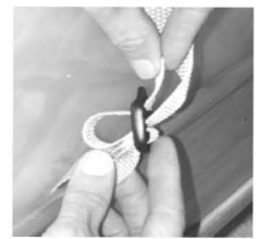
Fig.7 Retainer Strap

Hold the bed open, slide your mattress in place, and wrap and buckle the retainer straps at the head and foot. These retainers are designed to lie under linens and not interfere with use of the bed. Any excess strapping may be tucked under the mattress. You MUST use these straps to retain the mattress in place. Without these straps, the mattress may fall out of the tray to the floor when closed, preventing the bed from opening. DO NOT try to force the bed open!!