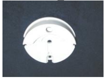
2 Wall Mounts