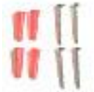
4 Anchors (red) 4 Screws