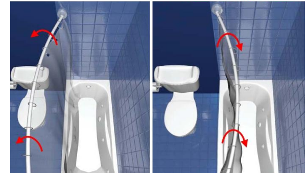
OUT - Shower Position IN - Space Saving Position

To protect our environment, The shipping box for The Original Rotator Rod™ has been designed to use as little packing material as possible.