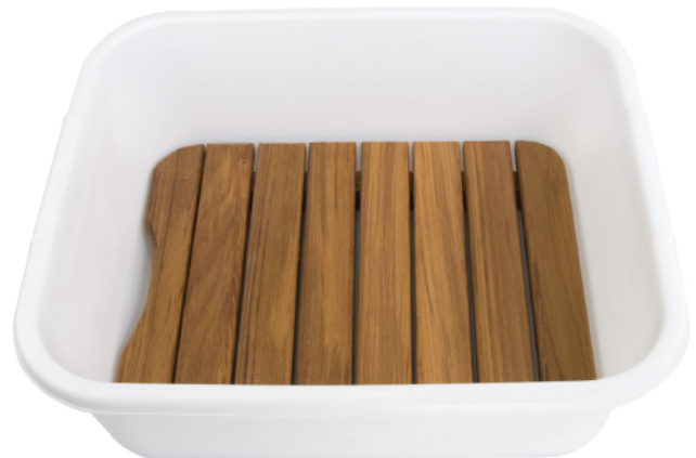
Size to fit a 15 quart container