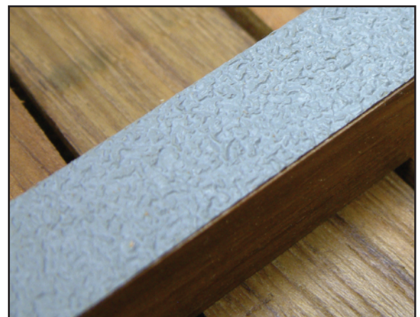
Rubberized Bonded Strip