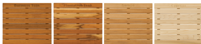
Burmese Teak Plantation Teak Garapa Cypress