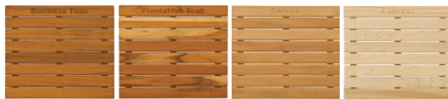
Burmese Teak Plantation Teak Garapa Cypress