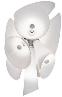
○ FU455009 White