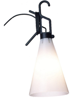
● FU378030 Black