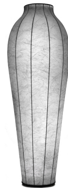
○ FU167009 White