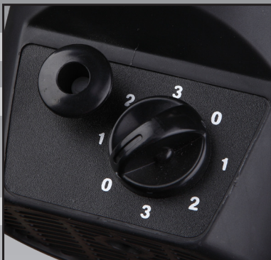
3 Speed Setting