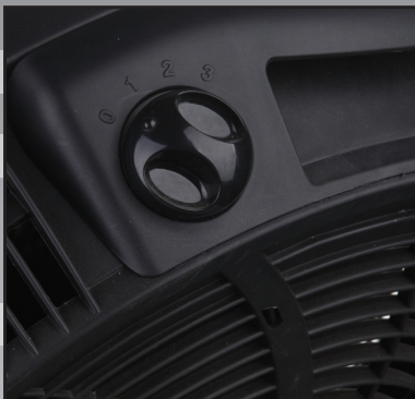
3 Speed Setting