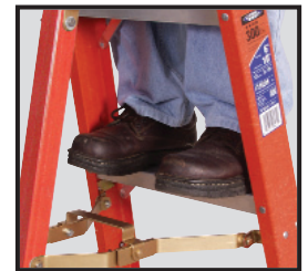
Extra clear-width for comfortable climbing; lower spreader location for open work area

Molded external rail shield helps protect against abrasion and rail damage