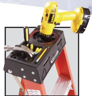
Tool-Tra-Top® with drill holster, tools and paint can holder