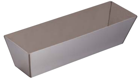
HELI-ARC STAINLESS STEEL MUD PAN