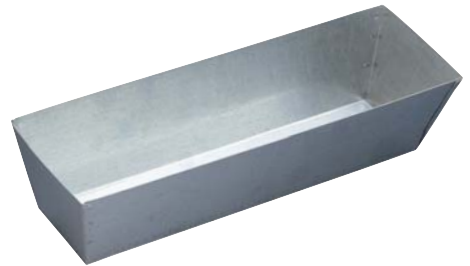
GALVANIZED MUD PAN