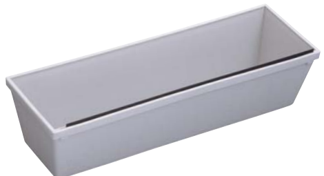
PLASTIC MUD PANS