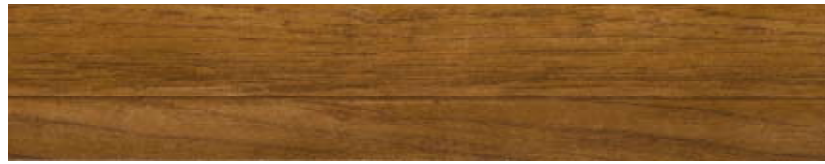
Golden Oak 8" x 24"

Nothing symbolizes heritage and tradition more than plank hardwood flooring. The Heritage™ series brings this classic look into the modern world by duplicating planked wood flooring in glazed ceramic. One can recreate the beautiful look of hardwood floors while enjoying the ease of maintenance that a ceramic tile affords. All four traditional hardwood floor colors including Cherry, Golden Oak, Mahogany, and Walnut are available in 8" x 24", 6" x 24" and 4" x 24".