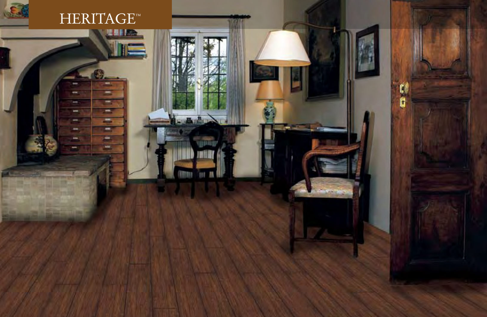
Heritage™ Walnut 6" x 24"