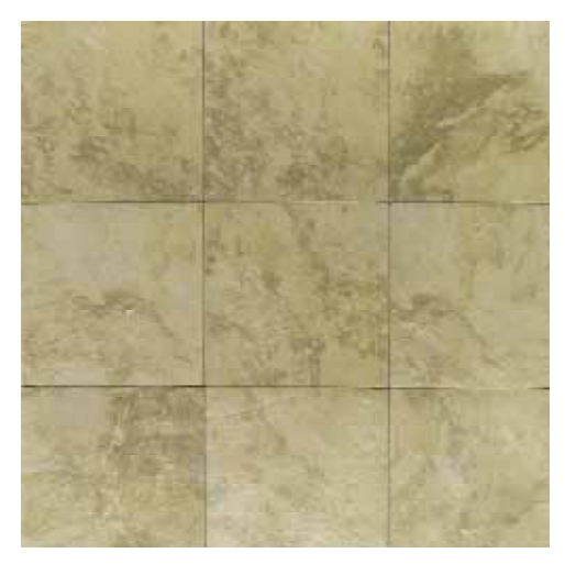
Millstone Beige AM85