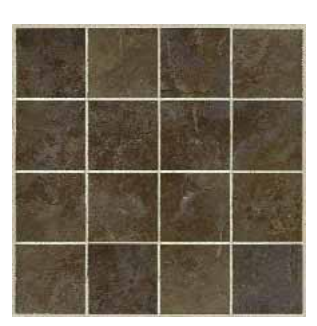
Bowling Green AM88 Mosaic 3" x 3"