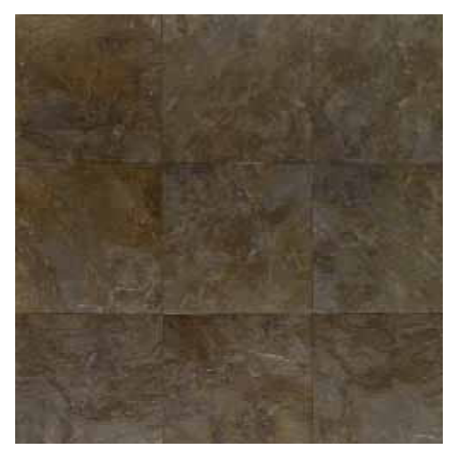
Bowling Green AM88