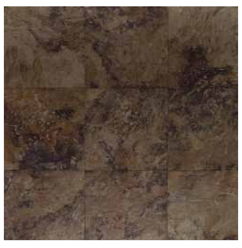
Derby Brown AM89