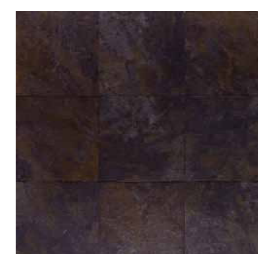
River Moss AM87