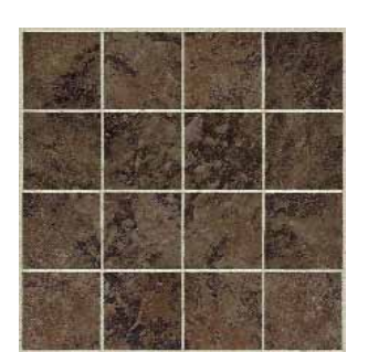
Derby Brown AM89 Mosaic 3" x 3"