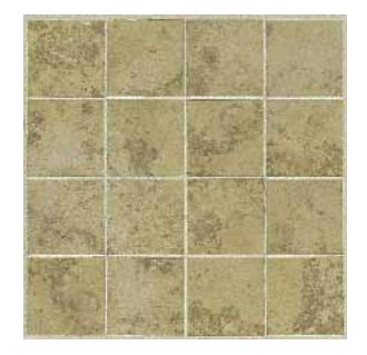
Millstone Beige AM85 Mosaic 3" x 3"