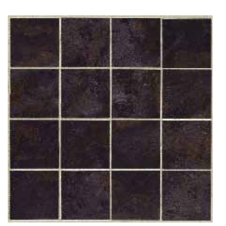
River Moss AM87 Mosaic 3" x 3"