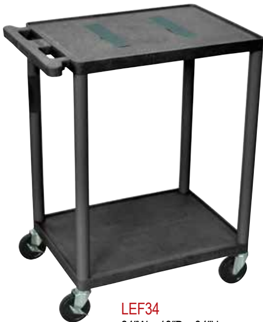
LEF34 24"W x 18"D x 34"H