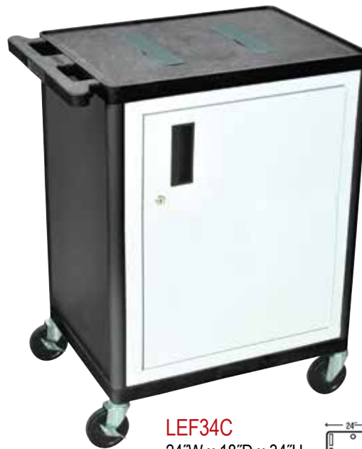
LEF34C 24"W x 18"D x 34"H