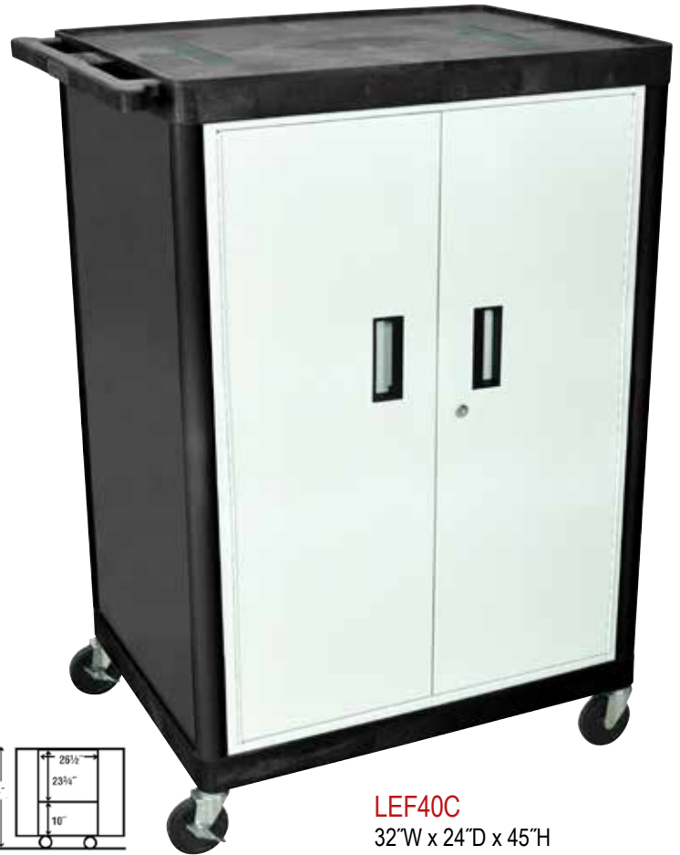
LEF40C 32"W x 24"D x 45"H