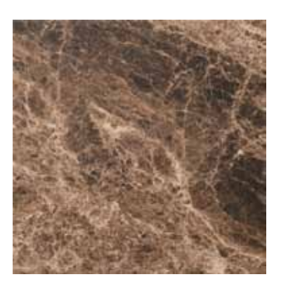
UK2F Emperador Mocha 19<sup>9</sup>/<sub>16</sub>" x19<sup>9</sup>/<sub>16</sub>"