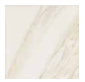
UK2A Calacatta Pearl 12<sup>15</sup>/<sub>16</sub>" x12<sup>15</sup>/<sub>16</sub>"