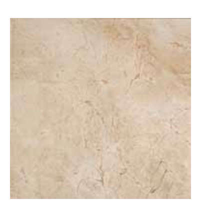
UK2E Marfil Cream 19<sup>9</sup>/<sub>16</sub>"x19<sup>9</sup>/<sub>16</sub>"