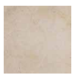
UK2B Marfil Cream 12^{15}/_{16}"x12^{15}/_{16}"