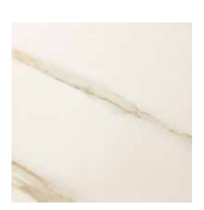
UK2D Calacatta Pearl 199/16" x199/16"