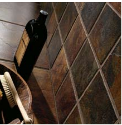
Floor: Imperial Rust 12"x12" Wall: Imperial Mix 6"x6"