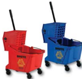
Color Coded Mopping Combo Pack