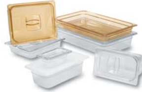
Cold & Hot Food Pans