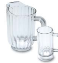
Bouncer® Pitchers & Mugs