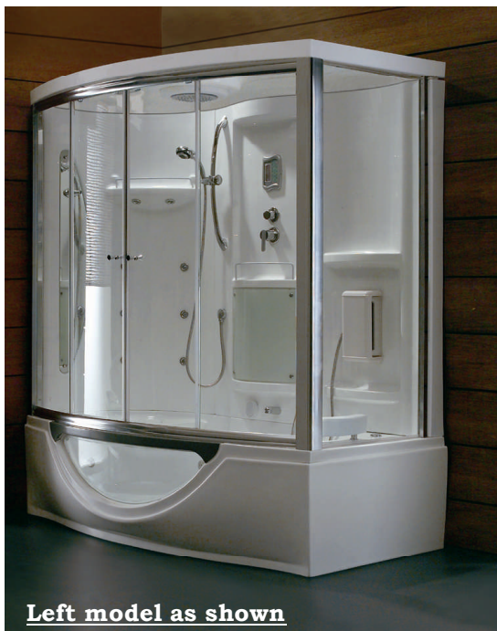
Left model as shown