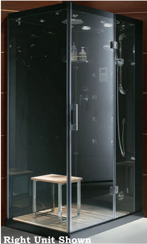
Right Unit Shown