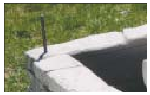
4. Insert a spike to secure the 2 sections together, but do not hammer into the ground until you are finished with the complete layout.