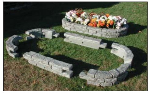
Select a layout configuration; some suggested layouts are on the previous page, or design your own. Lay the RockLock Wall System modules down in the rough locations.