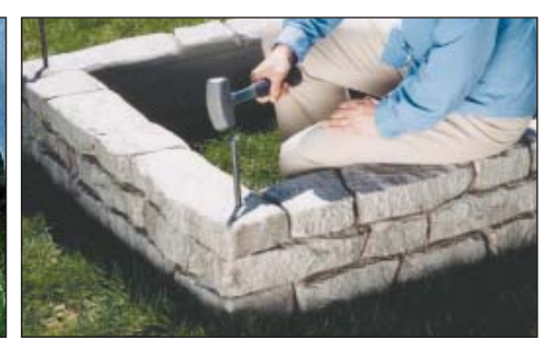
6. When you are finished, make sure the structure is where you want it to be, then hammer the steel spikes into the ground.