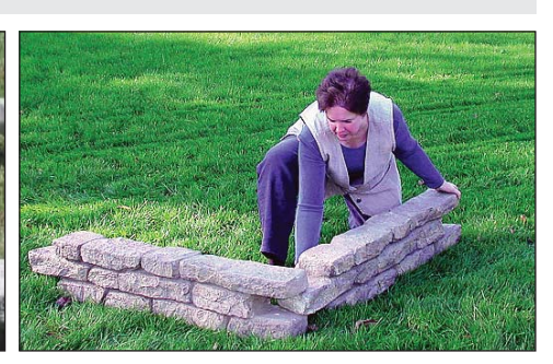
Interlock 2 sections together: WallRocks can be joined at either a 90-degree angle or as a straight line.