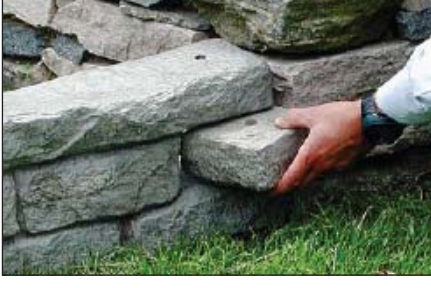
Complete your layout by connecting additional WallRocks, CurveRocks or EndRocks.