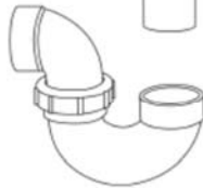
* 1½" ABS Trap*