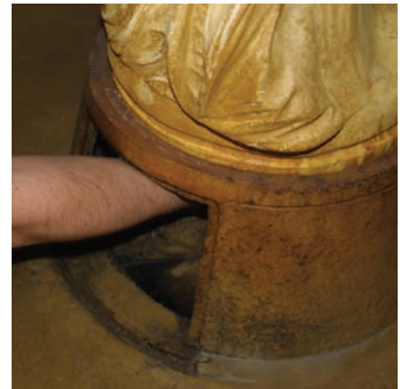
Securing the PVC bolt and washer.