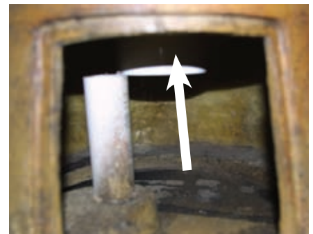
Inside of pedestal with PVC screw attached.