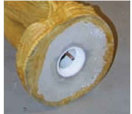
Copper fountain tube.