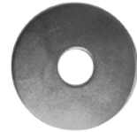
(12) 1 1/4" washers