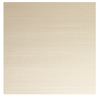
FIRELIGHT FLICKER SK50 FIRELIGHT FLICKER SK60 Thin Tile*