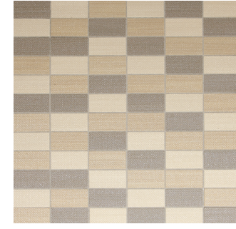
WARM BLEND MOSAIC SK56 (EMBER FLARE, TOASTED LUSTER & FIRELIGHT FLICKER)