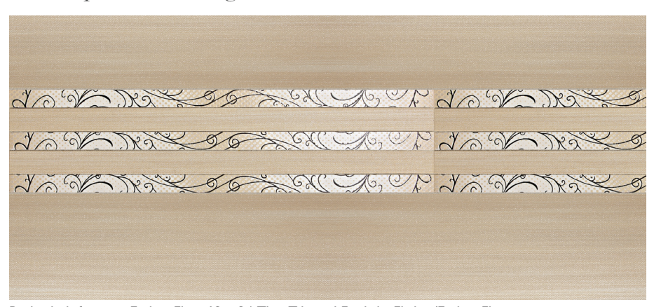
Backsplash features Ember Flare 12 \times 24 Thin Tile and Firelight Flicker/Ember Flare 6 \times 24 Thin wall Decorative Accent.