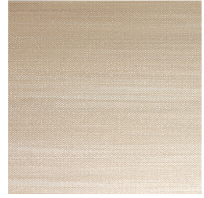
EMBER FLARE SK51 EMBER FLARE SK61 Thin Tile*