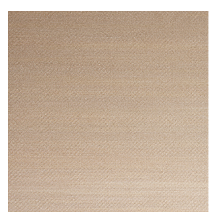
TOASTED LUSTER SK52 TOASTED LUSTER SK62 Thin Tile*