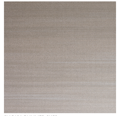
SMOKY GLIMMER SK53 SMOKY GLIMMER SK63 Thin Tile*