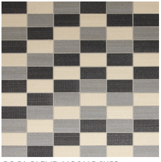
COOL BLEND MOSAIC SK55 (FIRELIGHT FLICKER, SMOKY GLIMMER & MIDNIGHT GLOW)