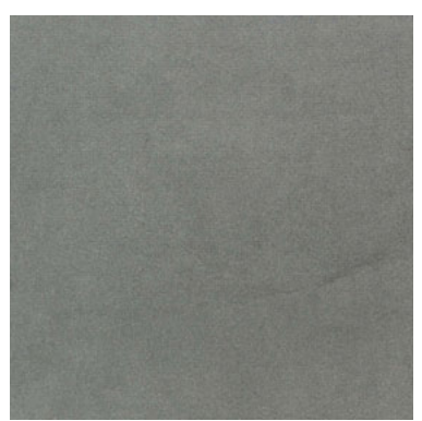
TECHNO GRAY VI51