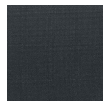
TECHNO BLACK VI55