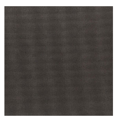
TECHNO BROWN VI54