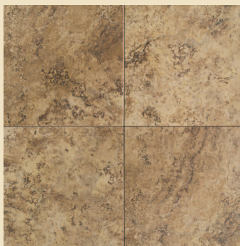
Caramel Haze TV92