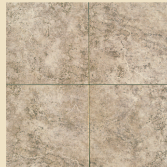
Toasted Almond TV91