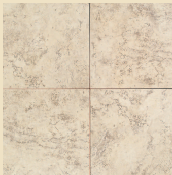
Fresco Cream TV90