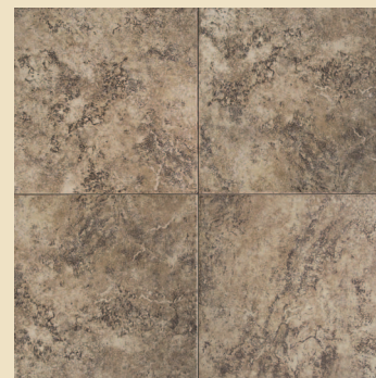
Chocolate Mousse TV93

The natural beauty of ceramic tile lies in its subtle variation of shades. Manufactured tiles may vary from tiles shown.