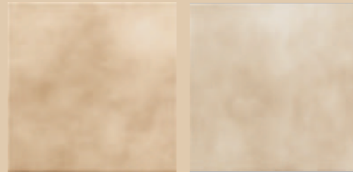
Aspen 1525 Vail 1535