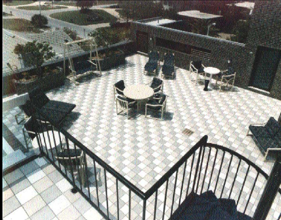
Photos feature Sierra tile in Rainier 1500, Jasper 1526 and Vail 1535.