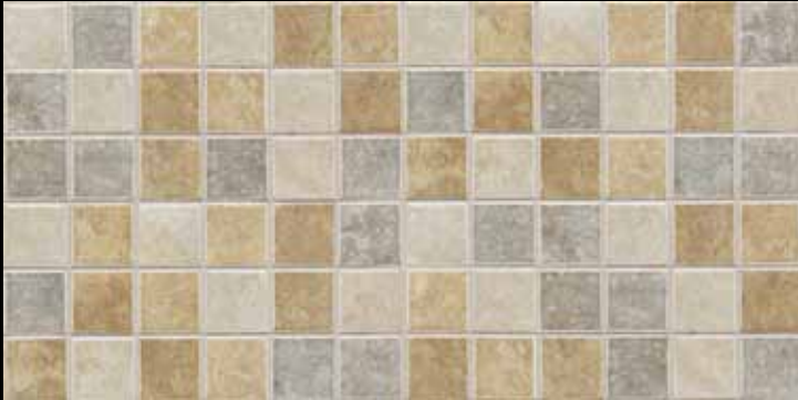
UNIVERSAL MOSAIC 2 x 2 SW96