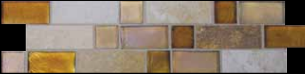
SMOKY TOPAZ BLEND SW97