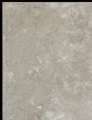
CASTILLIAN GRAY SW92