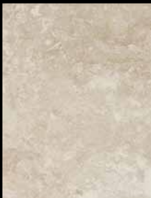
SERENE WHITE SW90