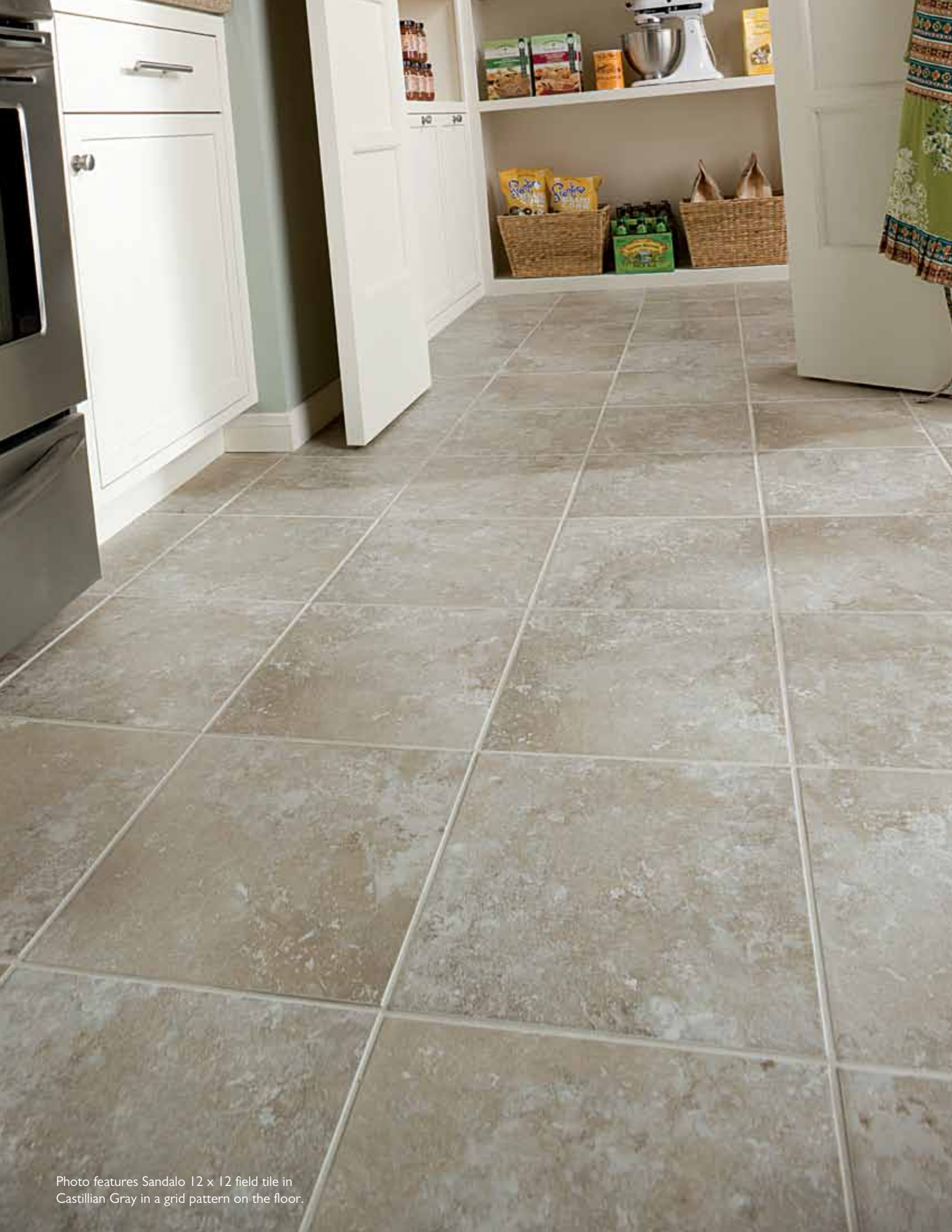
Photo features Sandalo 12 x 12 field tile in Castillian Gray in a grid pattern on the floor.