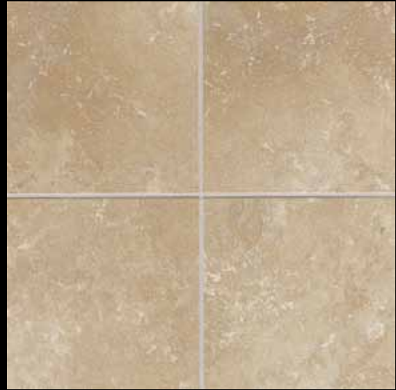
ACACIA BEIGE SW91