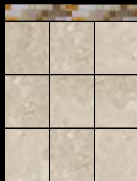
GRID PATTERN WITH ACCENT STRIP