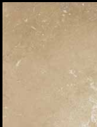
ACACIA BEIGE SW91