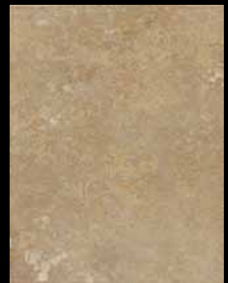
RAFFIA NOCE SW93