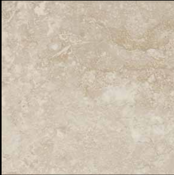
SERENE WHITE SW90