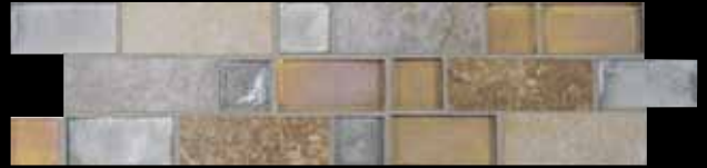
ZIRCON BLEND SW98