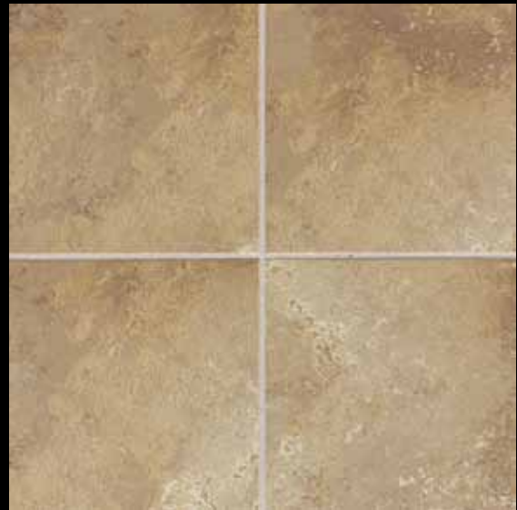
RAFFIA NOCE SW93