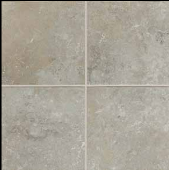
CASTILLIAN GRAY SW92