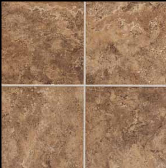
OLYMPUS BROWN PT97