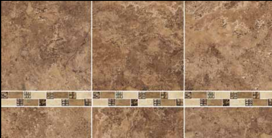
Backsplash features Olympus Brown 12 x 12 field tile with Stonegate 2 x 12 decorative accent.