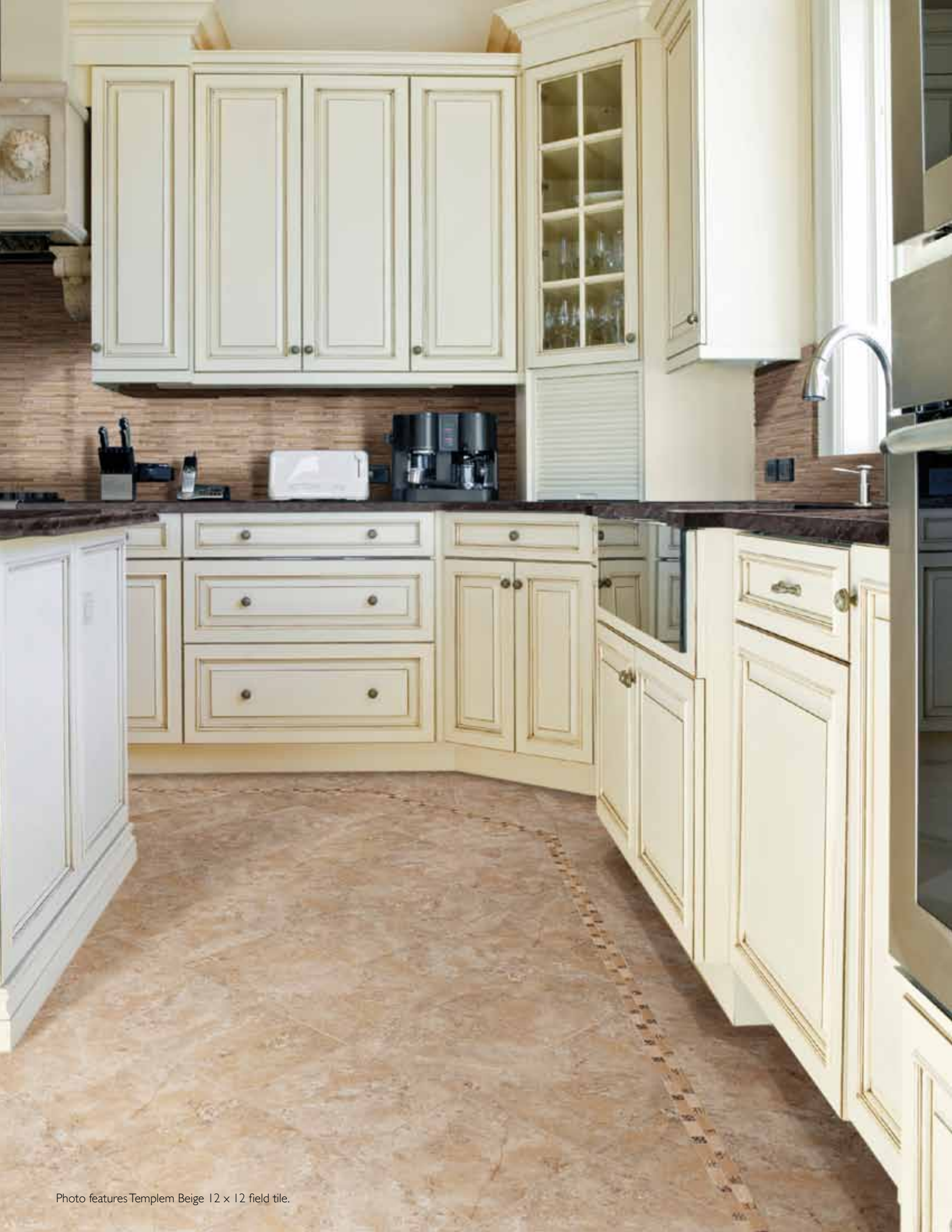
Photo features Temple Beige 12 x 12 field tile.