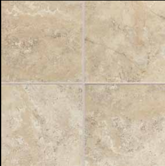
CORINTH CREAM PT95