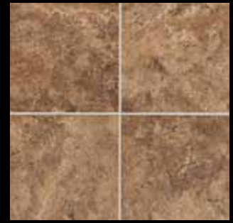
OLYMPUS BROWN PT97