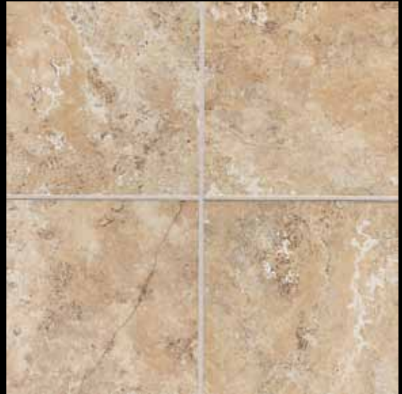
TEMPLE BEIGE PT96