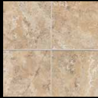
TEMPLE BEIGE PT96