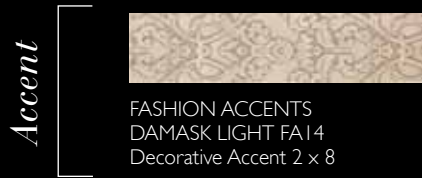
FASHION ACCENTS DAMASK LIGHT FA14 Decorative Accent 2 x 8