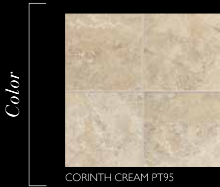
CORINTH CREAM PT95