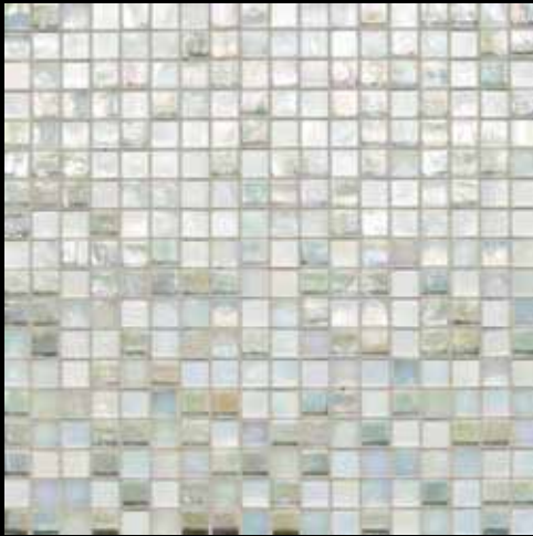
ST. MORITZ CL65*