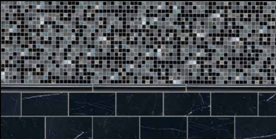
Backsplash features Manhattan 1/2 x 1/2 mosaic with Marble Nouveau Nero 3 x 6 field tile and 1 x 12 pencil rail.