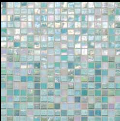
SOUTH BEACH CL71*