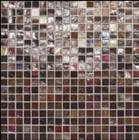
MONTE CARLO CL63**