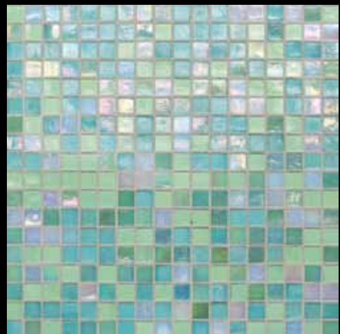
ST. THOMAS CL70**