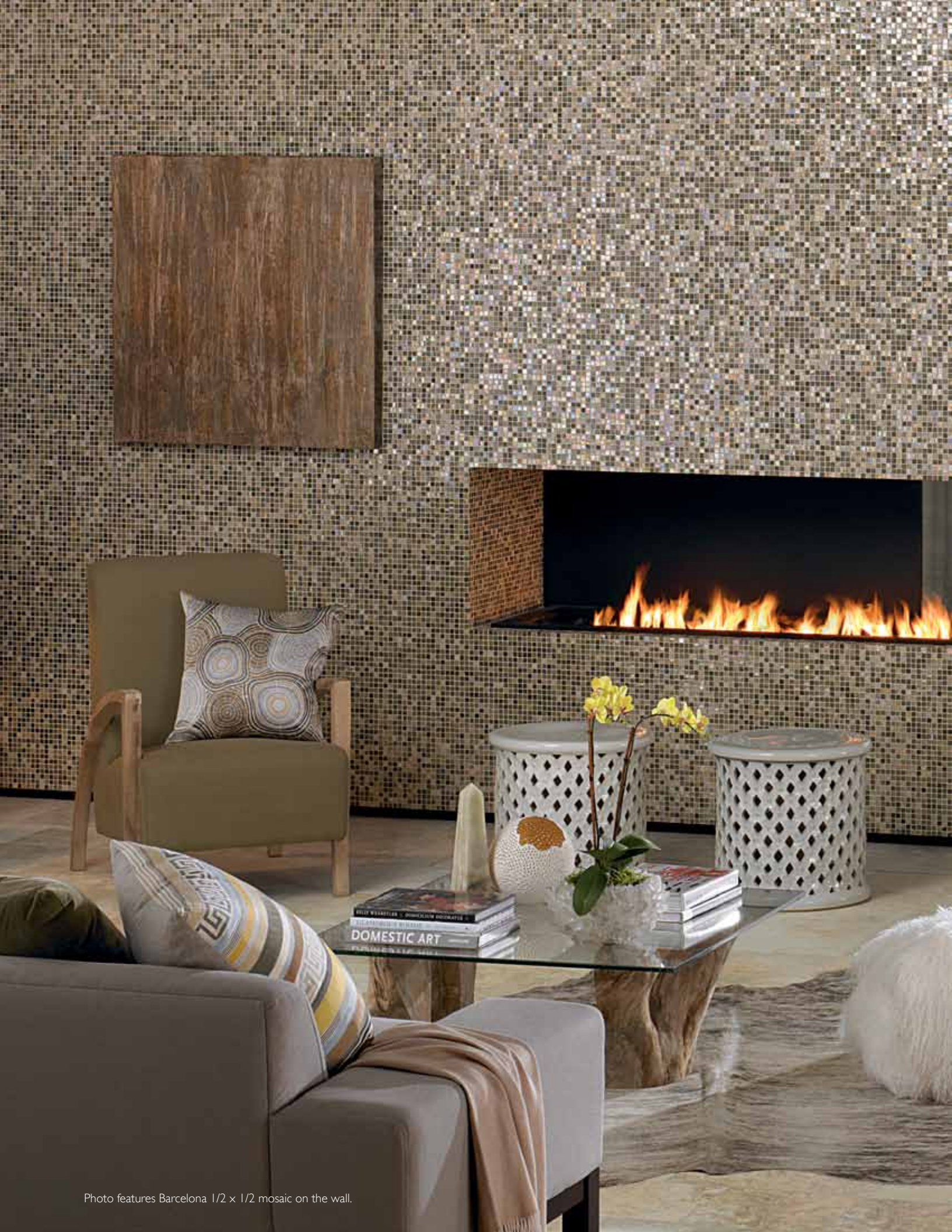
Photo features Barcelona 1/2 x 1/2 mosaic on the wall.