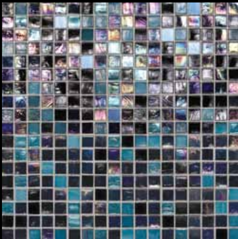
LAS VEGAS CL69**