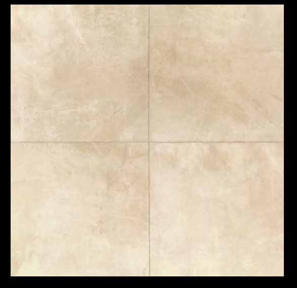
Boulevard Beige CN90