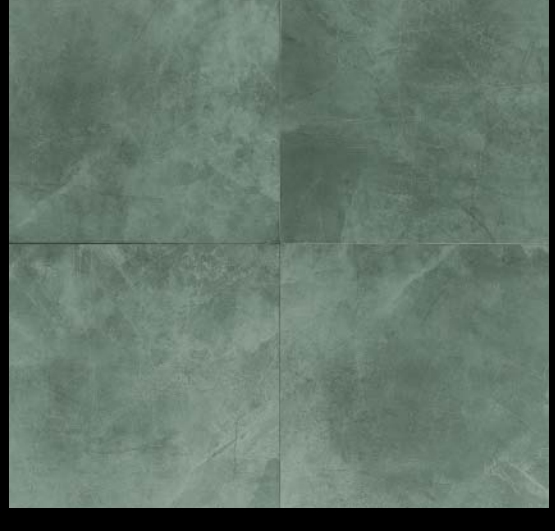
Steel Structure CN91