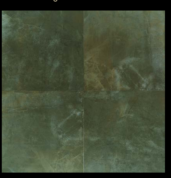
City Elm CN92