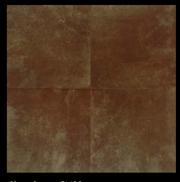
Plaza Rouge CN93