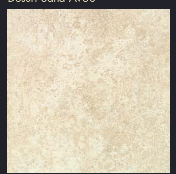
Desert Sand AV50