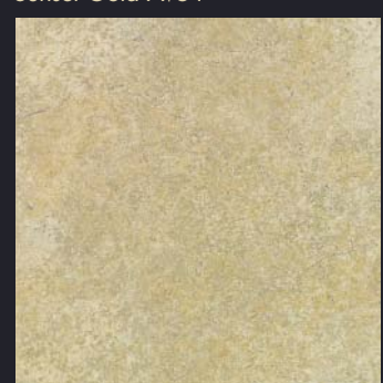
Sunset Gold AV51