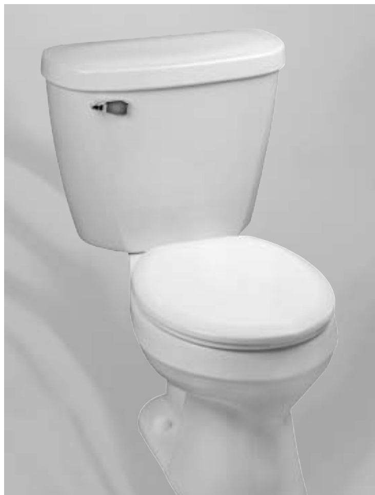
Model 380-386 Shown with SB1175 SmartClose™ Toilet Seat